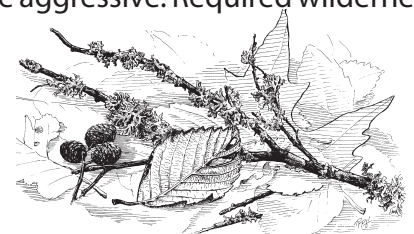
Alder and maple leaves, ©1977 from Northwest Trees, Ramona Hammerly. Reprinted with permission of publisher, The Mountaineers Books, Seattle.

No pets on trails. Pets must be on a leash at all times. Do not approach elk; they can be aggressive. Required wilderness permits for all overnight backpacking are available at the two Quinault ranger stations, or in Port Angeles and Forks.